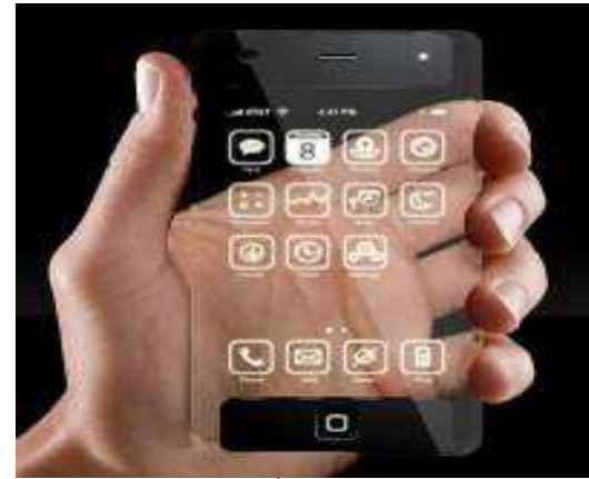
Fig. 8 V<sup>th</sup> Generation

5G is the name currently being given to the next generation of mobile data connectivity that will come after the last drop has been ringed from 4G.It will provide unbelievably fast broadband speeds, but more importantly it will have enough capacity wherever you go to perform every function you want it to without a drop in speed or connection, no matter how many people are connected at the same time. It represents the wireless telco echo system beyond LTE/EPC. It aims to provide a new radio access network with ultra capacity, low delay and energy efficiency for an extremely high number of devices and applications. 5G represents the complete echo system: core network, convergence with 3rd party wireless, fixed and satellite backhaul, management, supporting the convergence of 4G legacy wireless and the efficient endto-end application delay. The new 5G Radio Access Network (RAN) wants to use more efficiency the radio resources by enlarging its spectrum in very dense areas> 66Hz, and with better spectral efficiency <66 Hz.