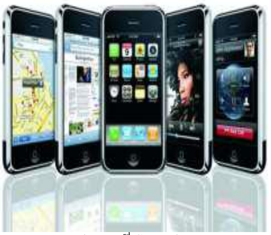
Fig. 6 III<sup>rd</sup> Generation

increased. The data are sent through the technology called broadband access, Multimedia Messaging Service (MMS), Packet Switching. Voice calls are interpreted through video chat, mobile TV, HDTV content, Digital Video Circuit Switching. Along with verbal communication it Broadcasting (DVB), minimal services like voice and data, includes data services, access to television/video, new and other services that utilize bandwidth. services like Global Roaming.