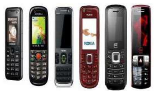
Fig. 5 II<sup>nd</sup> Generation

2G emerged in late 1980s. It uses digital signals for voice transmission and has speed of 64 kbps.