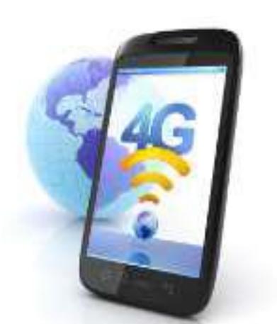
Fig. 7: IV<sup>th</sup> Generation

The 5G terminals will have software defined radios and modulation schemes as well as new error-control schemes that can be downloaded from the Internet. The development is seen towards the user terminals as a focus of the 5G mobile networks. The terminals will have access to different wireless technologies at the same time and the terminal should be able to combine different flows from different technologies. The vertical handovers should be avoided, because they are not feasible in a case when there are many technologies and many operators and service