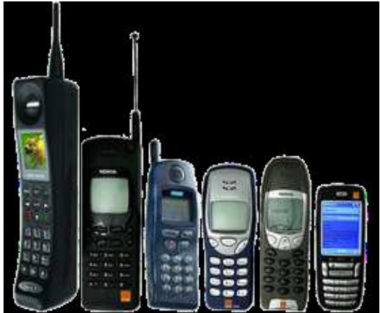
Fig. 4 I<sup>st</sup> Generation

Mobile communication has become more popular in last few years due to fast revolution in mobile technology.